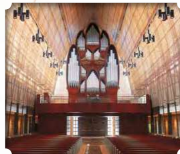
Miami - United States of America Church: Church of the Epiphany Builder: Ruffatti Style: American-symphonic