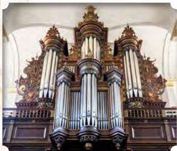
Copenhagen - Denmark Church: Helligåndskirken Builder: Marcussen & Søn Style: French-symphonic