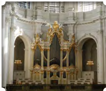
Dresden - Germany Church: Hofkirche Builder: Silbermann Style: Baroque (South-German)