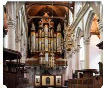
Amsterdam - The Netherlands Church: Oude kerk Builder: Vater-Müller Style: Dutch-romantic