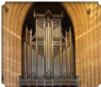
Liverpool - United Kingdom Church: Mossley Hill Church Builder: Willis & Sons Style: English-romantic