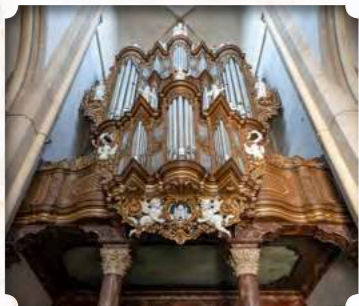
Kampen - The Netherlands Church: Bovenkerk Builder: Hinsz Style: Baroque (North-German)